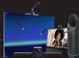
VIDEO CONFERENCE SOLUTIONS