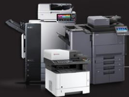
PRINT, COPY & SCAN SOLUTIONS

Smart Idea offers a comprehensive suite of solutions, designed to meet the evolving needs of businesses in South Africa