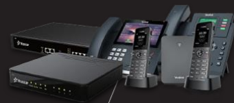
VOICE, DATA & FIBRE SOLUTIONS