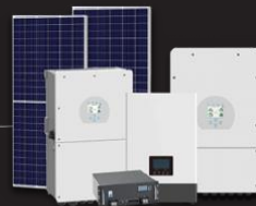
SOLAR POWER SOLUTIONS